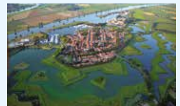
City of Heusden