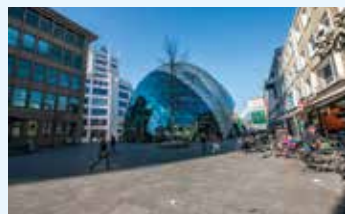
City of Eindhoven