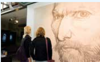
Vincentre - Nuenen