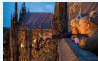
City of Den Bosch