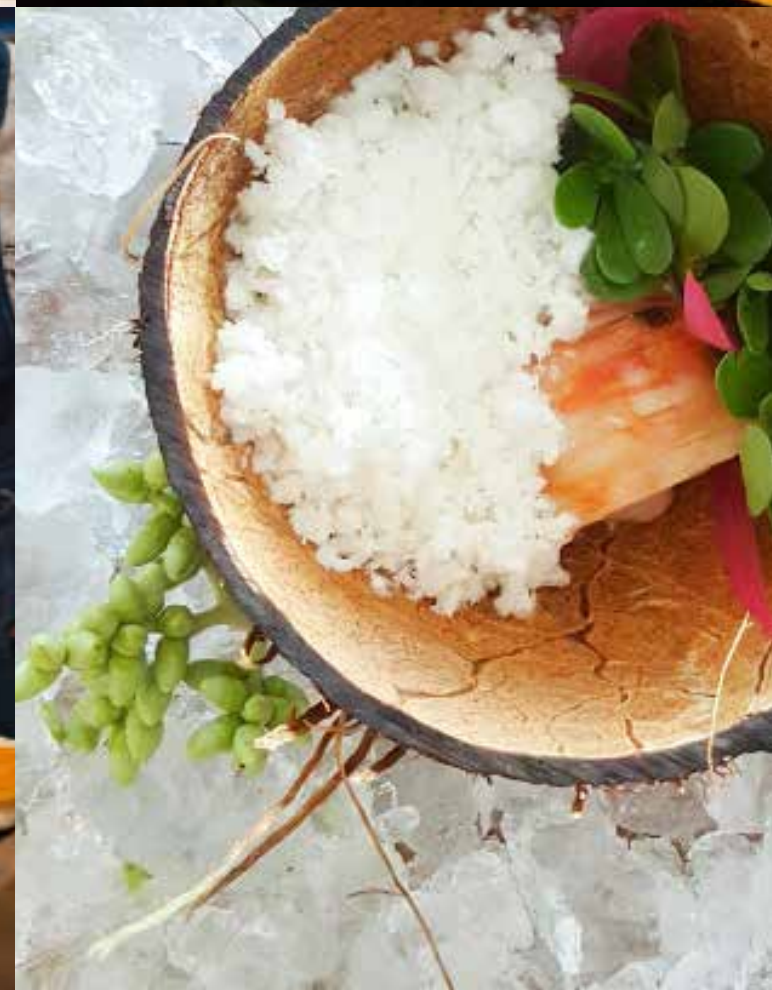
Proyecto Caribe.co (bottom right)