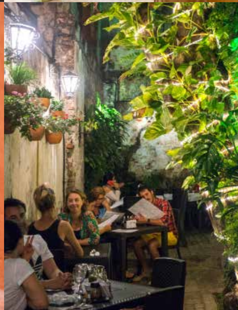
Proyecto Caribe.co (top left)

Previous pages: dome of the Cathedral of San Pedro Claver (left); Restaurant-Bar Alma, a gourmet restaurant with live music and a cocktail bar (right).