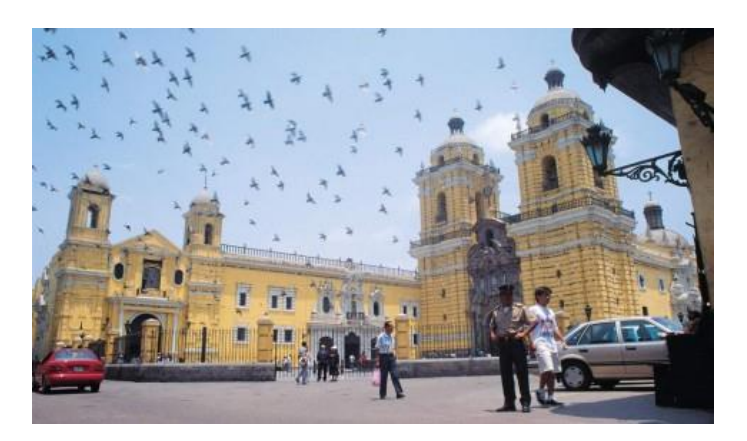
Day 4 | Thursday May 4: Lima – Paracas (ca. 246km / 3,5 hours)

Our first SouthAmeriCar driving day has arrived! Today we drive from Lima to Paracas. We leave the big capital and follow the road south across the Panamericana Sur. You will pass several villages and small towns. Sometimes the desert landscapes are interrupted by green river beds that surround the riverbanks. In the city of Pisco, follow the signs to Paracas. Your hotel is located near the sea. Paracas is a peninsula south of Lima. In this area many archaeological findings are done. In addition, the area is an important nature reserve where lives many species of birds, like flamingos and albatrosses. The nutrient rich coastal waters takes also care of many animals who are living on the nearby Ballestas Island, like huge colonies of sea lions and humboltpinguïns.