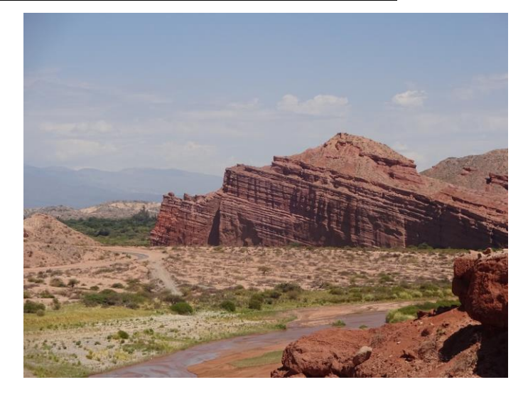
Day 18 | Thursday May 18: Salta – Corrientes (ca. 831 km / 12 hours)

We leave the mountains behind us and going on over the well-known Argentine pampas. No curves today but straight forward over the endless Ruta 16 to Resistencia and Corrientes. This route continuous through the outback of Argentine. In this farmland you rarely meet other travellers. In the evening you will arrive in Corrientes.