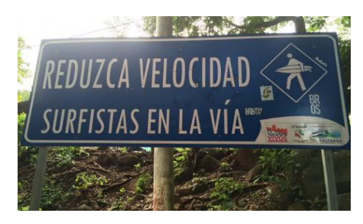
Day 12 | Thursday 14 October: El Tunco – Antigua (ca. 300 km / 5 hrs)

You leave El Salvador and continue to Guatemala. We recommend you to deviate the fastest route and make a small detour, driving the route from Sonsonate to Ahuachapan. This is the so-called Ruta de las Flores, a beautiful route. This route is known for its abundance of wild growing flowers with beautiful panoramic views of the mountain side of coffee plantations, lakes and dense cloudy forests. There are at least 30 coffee – producing municipalities in this region, including the most important: Apaneca, Ataco, Tacuba and Juavua. Next, follow the CA8 to the border Villa Nuevo / Las Chinamas.