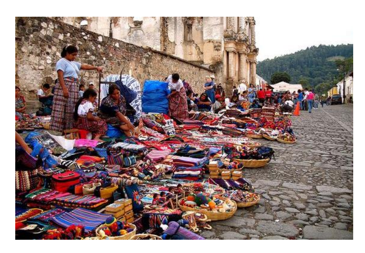
Day 14 | Saturday 16 October: Antigua – El Remate (ca. 550 km / 10 hrs)

You will drive further north to the Petén region of Guatemala. The tropical rainforest in the Petén is the largest rainforest of Central America and the flora even as the fauna is very various. The Maya culture have built their settlements two thousand years ago and their historic ceremonial Mayan centres are spread in this area. The most famous attraction is the National Park Tikal where various temples, pyramids and squares rise up above the jungle.