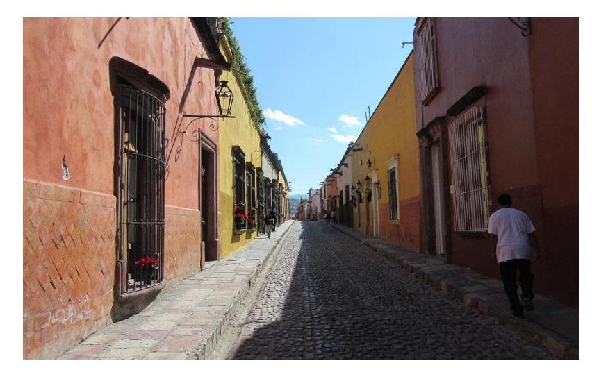
Day 29 | Sunday 31 October: San Miguel de Allende – Mexico City (ca. 275 km / 4 hrs)

The last route of this spectacular trip leads us to the capital Mexico City. It isn't a long drive today, so you can still make several stops along the way. For example, you can have a look in the colonial city of Queretaro, a city which was the capital of Mexico for three periods. You can also have a look at Teotihuacan, the enormous Aztec city. You will stay in the comfortable St. Regis Hotel centrally located on the Paseo de la Reforma.