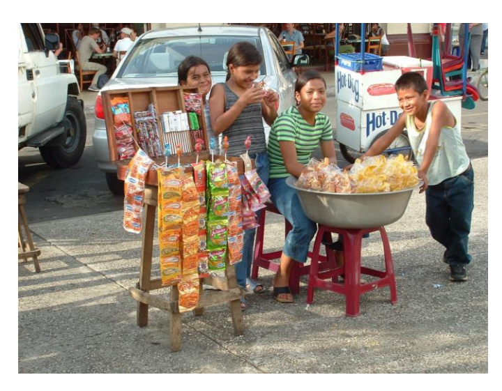
Day 11 | Wednesday 13 October: León – El Tunco (ca. 500 km / 8 hrs)

This day you have two border crossings. You will cross the border to Honduras and El Salvador. The destination for today is El Tunco, located in the southwest of El Salvador. El Tunco is a small surf village, 8 kilometres from Puerto La Libertad. Until a few years ago it was an unknown and quiet village, but nowadays it is crowded by backpackers and surfers. You will find nice bars and restaurants. Enjoy the spectacular sunset with the large rock formation in sight.