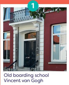
Old boarding school Vincent van Gogh