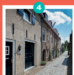
The Rozemarijnstraat in Willemstad