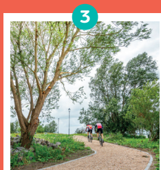
Cycle through Moerdijk and discover the many contrasts