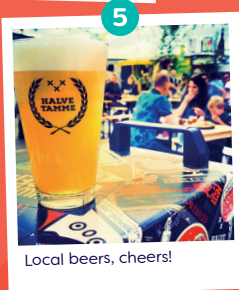
Local beers, cheers!