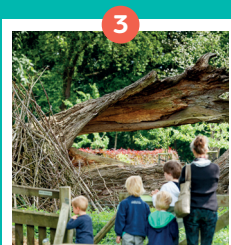
Priest's forest and Capuchin monastery, Langeweg