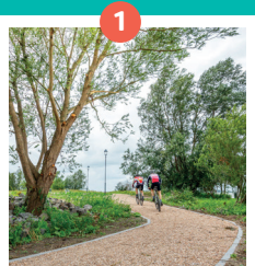
The Appelzak, Moerdijk village