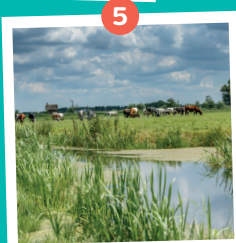
River Tonnekreek, between Willemstad and Klundert