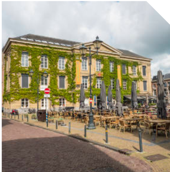
Tourist Information Office & the Gorcums Museum