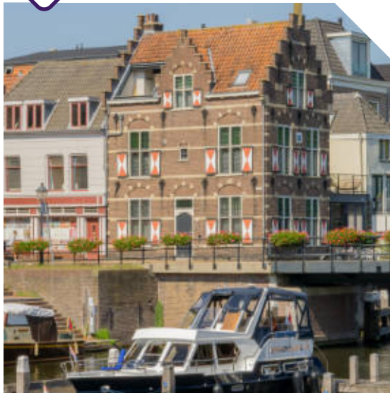
The fortified city of Gorinchem.