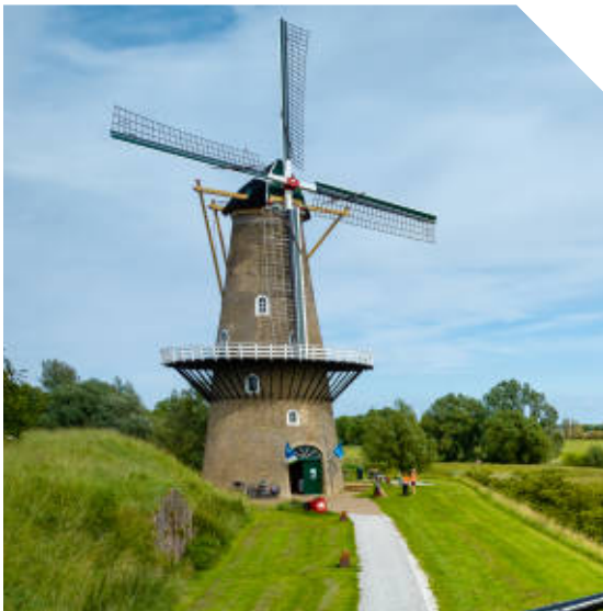
Molen de Hoop