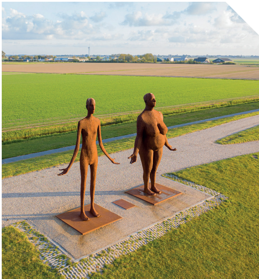
WACHTEN OP HOOGWATER (WAITING FOR HIGH TIDE) AT HOLWERD

It would be a mistake to think that the day is over just yet. After dinner, we visit the Lauwersnest visitor center to participate in a Dark Sky Excursion with the Staatsbosbeheer (Forestry Service). After this impressive tour in the pitch dark, we return to the hotel.