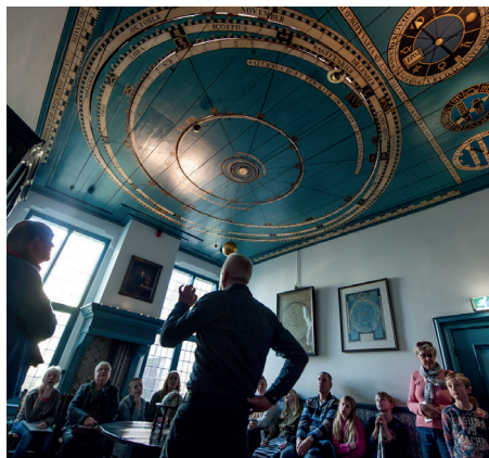
PLANETARIUM IN FRANEKER