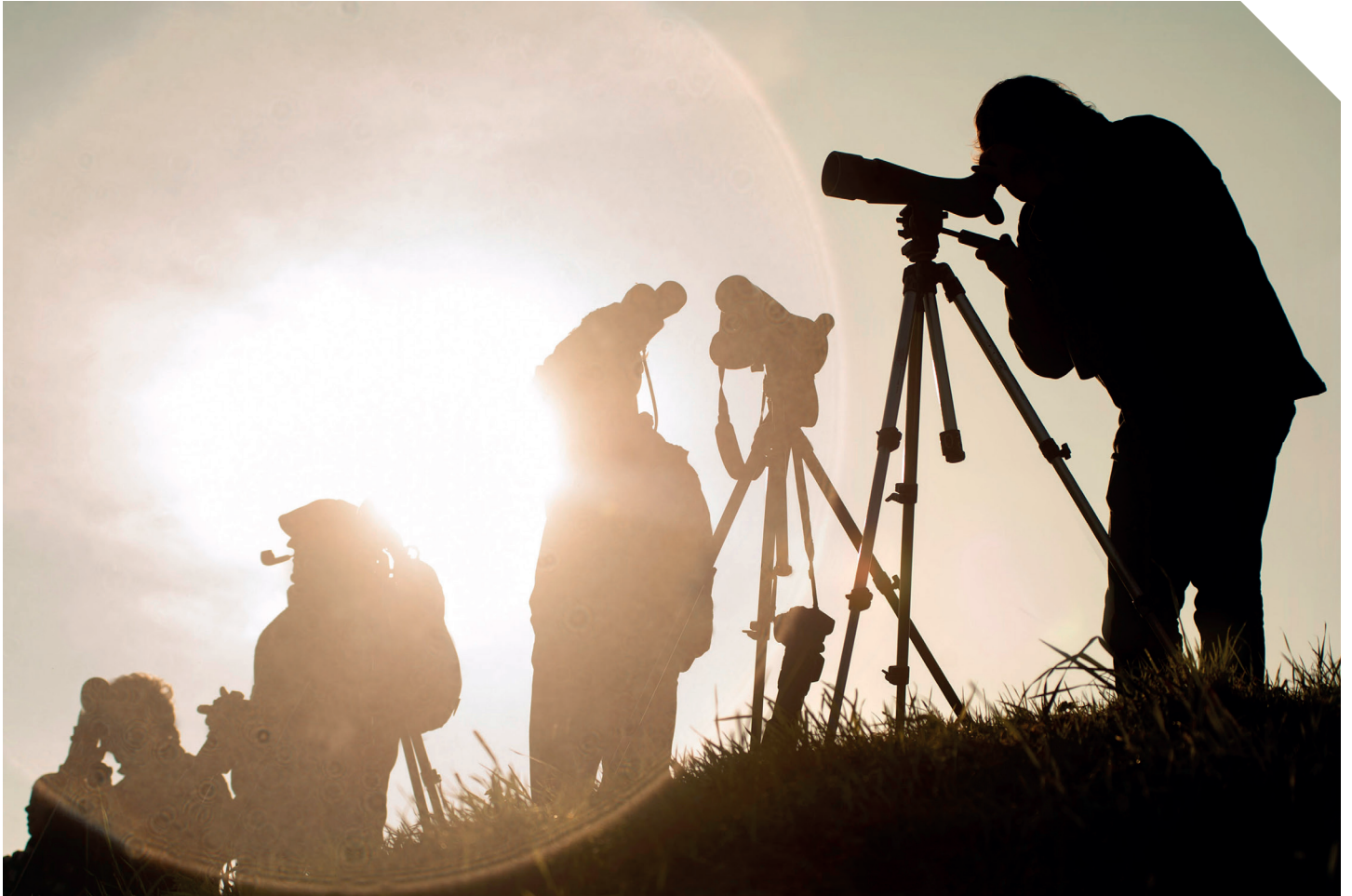
ALDE FEANEN NATIONAL PARK

The second day is spent in the heart of Friesland. In the Alde Feanen National Park, we step aboard an electric whisper boat to take a quiet trip through this unique area. This covered boat is powered by solar energy and can accommodate twenty-five people. Weather permitting, we'll have lunch outside in the fresh air.