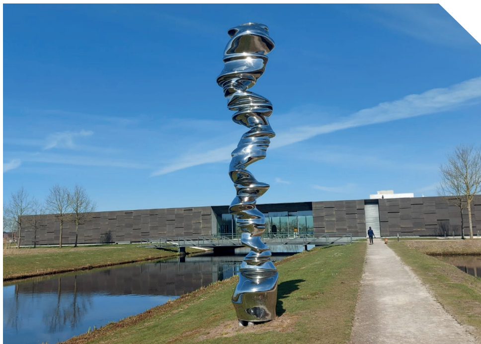
MUSEUM BELVÉDÈRE IN ORANJEWOUD

We end the trip with a good dose of culture. Leeuwarden-Friesland was the 2018 European Capital of Culture, and with good reason. The province is an excellent holiday destination for culture lovers. There are numerous festivals in the summer, such as the special Oranjewoud Festival. A festival that celebrates classical music in the woods of Oranjewoud. If you are here during this period, we recommend you spend a day visiting this special festival.