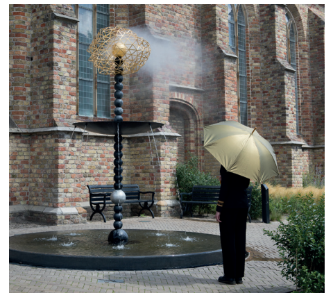
MIST FOUNTAIN IN FRANEKER

After visiting two National Parks, it's time for some history. On the third day we visit Hegebeintum, a unique village on the highest terp (man-made mound) in the Netherlands. Once you arrive you can see how high the village rises above sea level. It's a very special view! A guide gives us a tour of the terp and tells us all about the origin of this place.