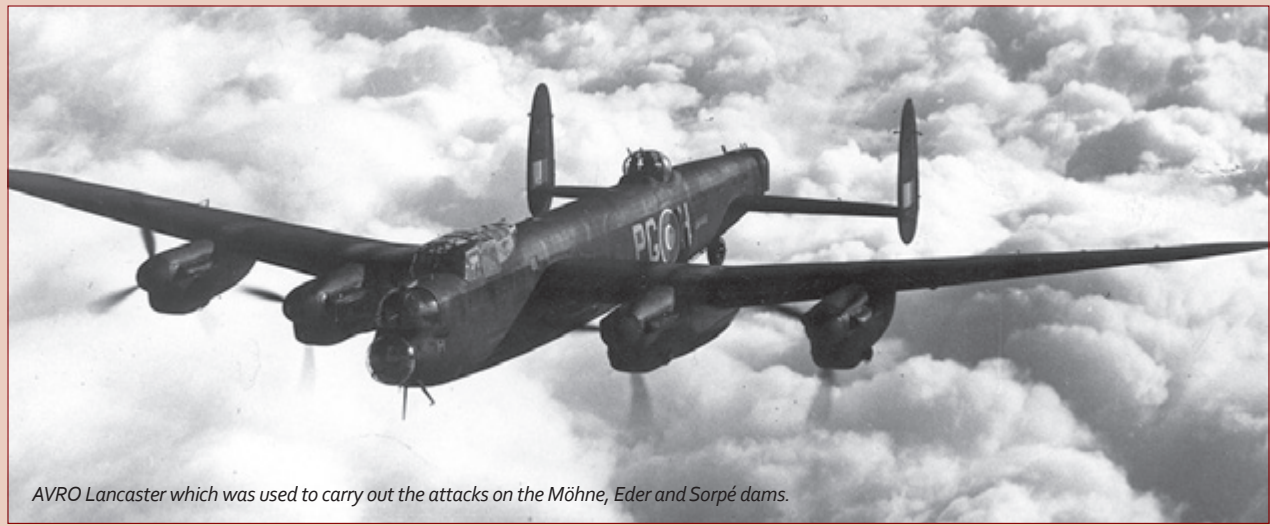
AVRO Lancaster which was used to carry out the attacks on the Möhne, Eder and Sorpé dams.