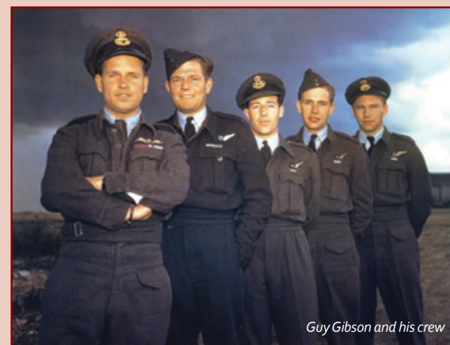
Guy Gibson and his crew

On 19 September 1944, Guy Gibson was flying a twin-engined bomber of the 627 squadron as master bomber together with squadron leader James Warwick as navigator. At the time, this De Havilland Mosquito fighter-bomber was a very sophisticated aircraft that was able to maintain high air speed levels (nearly 700 km per hour) at low altitudes. The pilot and navigator were seated side by side in this twin-engined aircraft. They were flying back to England following a bombardment on Rheydt and Mönchengladbach on that particular day in September. At around 22:45 h, the fighter-bomber was spotted over Steenbergen with a misfiring engine. This was caused by a mechanical defect and the aircraft ran out of fuel. Consequently, it crashed near a farm in the former West Graaf Hendrikpolder and burst into flames. Both crew members were found near the wreckage and buried in Steenbergen's local Roman Catholic cemetery.